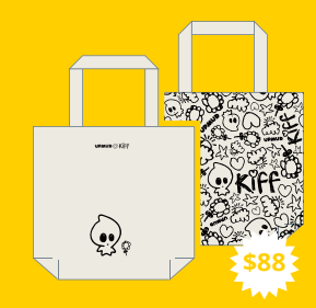
TOTE BAG 布袋