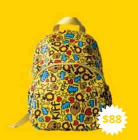
KIDS BACKPACK 章裝背囊