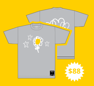
M/F男/女 & KIDS童裝 T-SHIRT