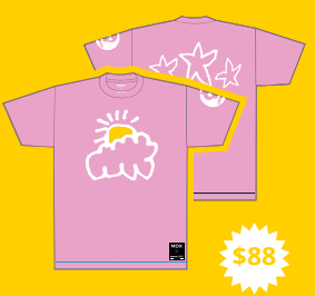
Unisex & KIDS童裝 T-SHIRT