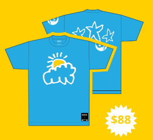
Unisex & KIDS童裝 T-SHIRT