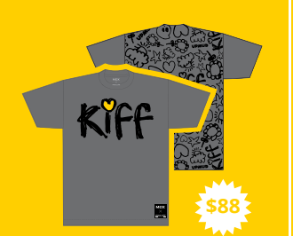
M/F 男/女裝 T-SHIRT